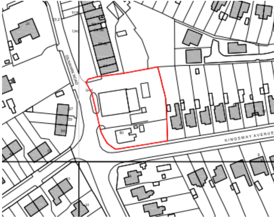
Aerial image with site boundary